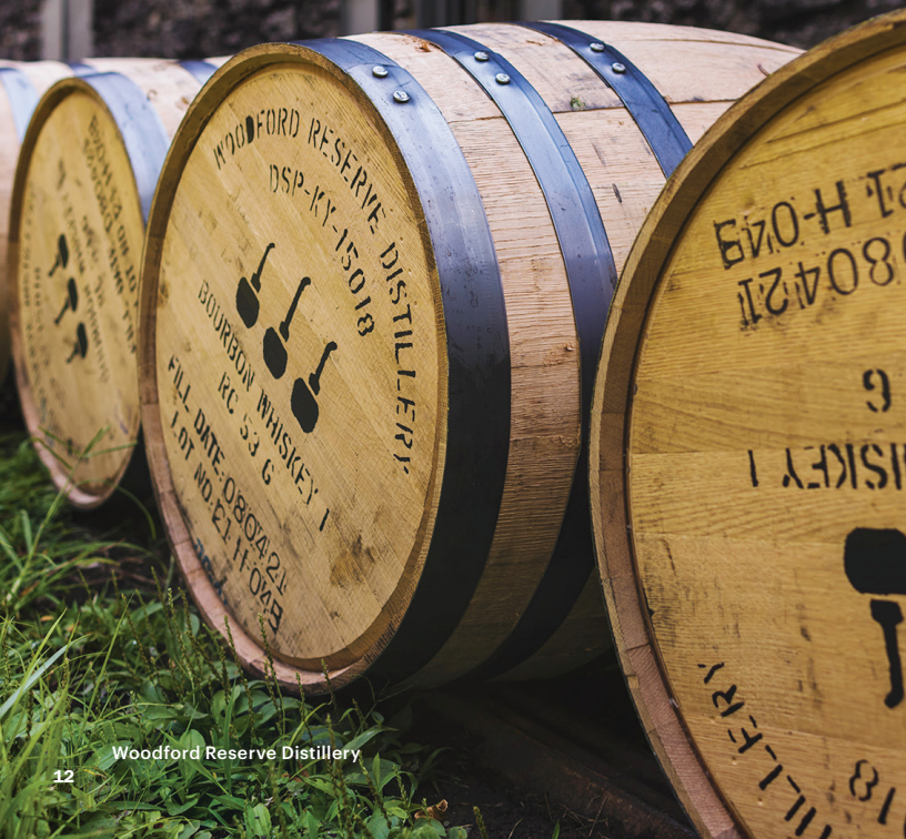
Woodford Reserve Distillery

Throughout the city, you'll find world-renowned bourbon bars and distilleries that offer perfected classic cocktails, imaginative new ones, and rare bourbon selections.