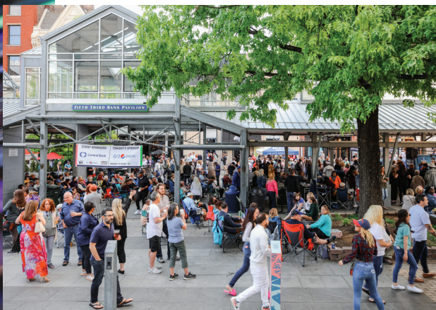
Thursday Night Live