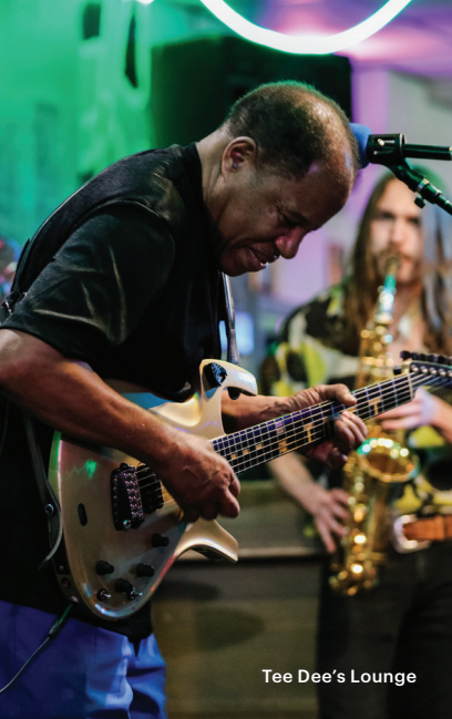
Tee Dee's Lounge