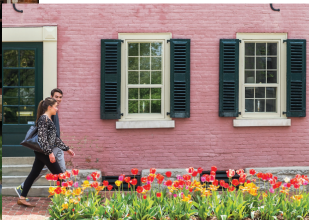
Gratz Park Historic District