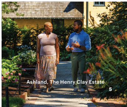
Ashland, The Henry Clay Estate