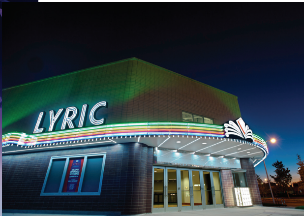
Lyric Theatre & Cultural Arts Center