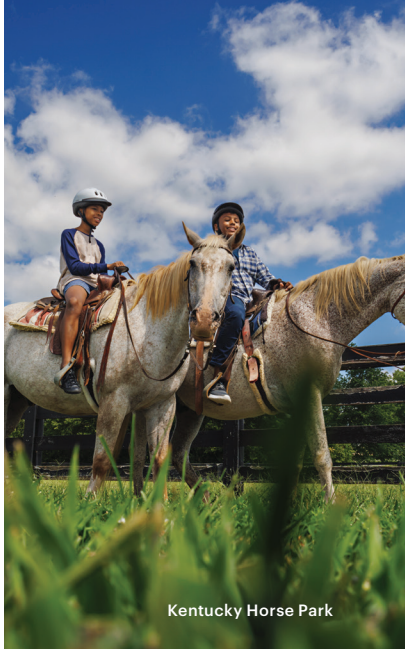
Kentucky Horse Park