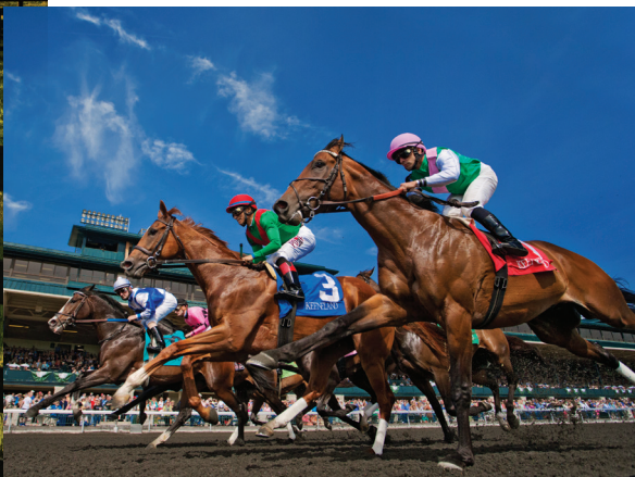
Keeneland Race Course