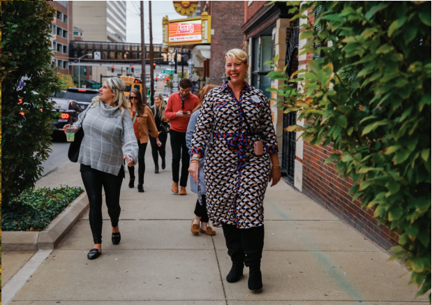
Bites of the Bluegrass Tour