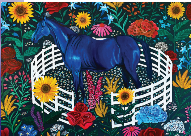
Big Lex in Flowers by Wylie Caudill