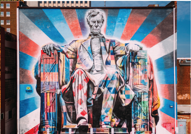
Abraham Lincoln mural