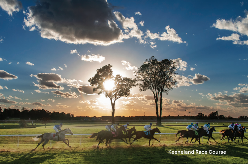
Keeneland Race Course