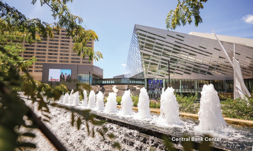
Central Bank Center

“Central Bank Center and Rupp Arena are exceptional facilities to accommodate groups of any size and are easily navigable within downtown Lexington. If you are looking for a centrally located destination with a vibrant downtown and superior facilities, do not overlook Lexington. It is truly a gem!”