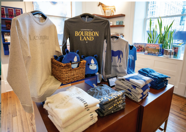
Lexington Visitors Center