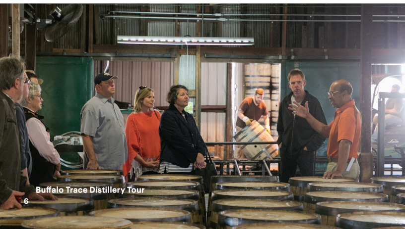
Buffalo Trace Distillery Tour