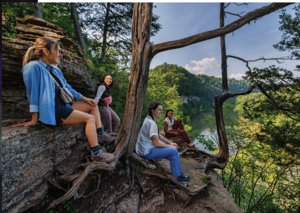
Raven Run Nature Sanctuary