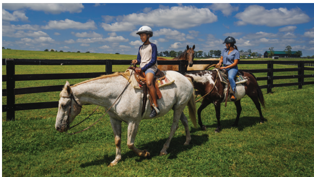
Kentucky Horse Park