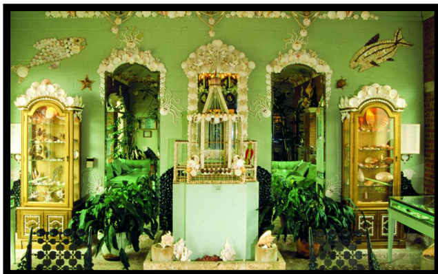
The Headley-Whitney Museum features a fascinating collection of decorative art objects.

Enjoy lunch and a tour of Headley-Whitney Museum . Established in 1968 by artist and jewelry designer George Headley, this unique museum features a fascinating and diverse collection of decorative art objects.