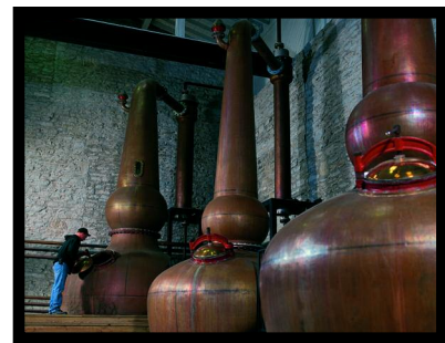
Bourbon was born in the Bluegrass more than 200 years ago. Today, more than 95% of all bourbon is produced in the state of Kentucky.