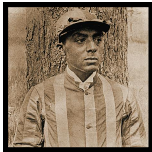
Isaac Burns Murphy, all-time winningest jockey, is buried at the Kentucky Horse Park.

Begin your day at Keeneland , Lexington's Thoroughbred racetrack. This National Historic Landmark is one of the most genteel, beautiful tracks in the world. As a blanket of early morning fog covers the ground, Keeneland becomes a sanctuary for the senses. Walk down to the rail and experience the unique sights and sounds of horses during their morning workouts. Enjoy breakfast at the Keeneland Track Kitchen , a gathering place for jockeys, trainers and owners. Or visit the Red Mile Harness Track , Lexington's Standardbred track. Named after the native red soil that covers the track, the Red Mile is Lexington's oldest existing racetrack, dating back to 1875.